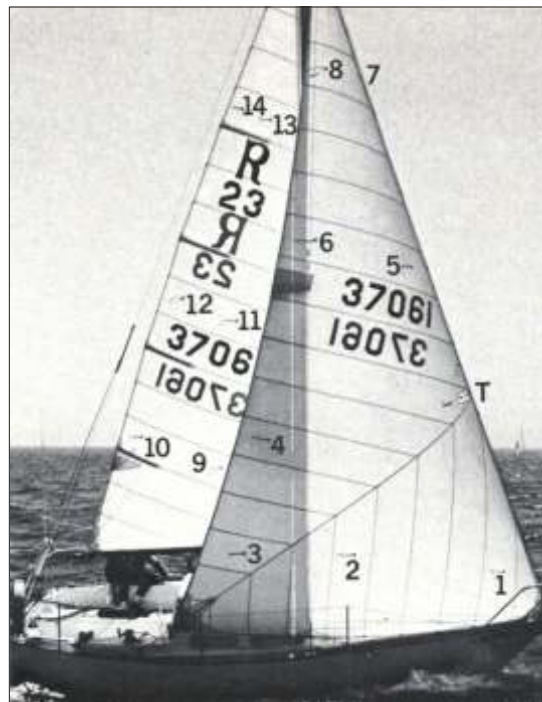
Photo 1. Telltale and tuft arrangement.

As we search for proper sail trim, we attempt to find the best compromise between all these effects. We want the genoa to help the mainsail without pushing it to the point where the mainsail's contribution to the total driving force is reduced. And we want the mainsail to be trimmed tightly enough so that it gives the maximum help to the genoa leech velocities without reducing its drive.